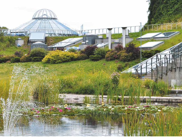
Roof of the Podlasie Philharmonic Orchestra in Białystok, Poland