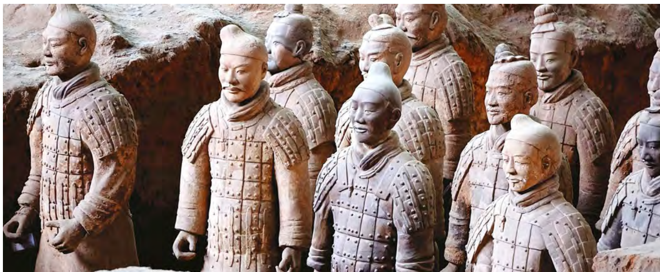
Famous terracotta army located in the tomb of the first Chinese Emperor Qin Shi

Inhabitants of the 'Middle Kingdom' had some reasons for such a perspective, since it resulted from the multitude of inventions that had been developed earlier than on the Old Continent. Consequently, it was a huge shock for them that, due to the weakness of the empire, they were dominated by Europeans in the 19 th century. Today, in turn, after a century of disgrace and humiliation, the madness of the Maoist era, and the subsequent reconstruction, China is once again a great power. The Chinese often do not perceive their homeland as a conventional nation state, but rather as a permanent natural phenomenon ("China has always existed at an impressive cultural level"), and therefore, they regard the current international situation not as a new phenomenon, but as a return to a natural state of affairs in which the 'Middle Kingdom' dominates over others.